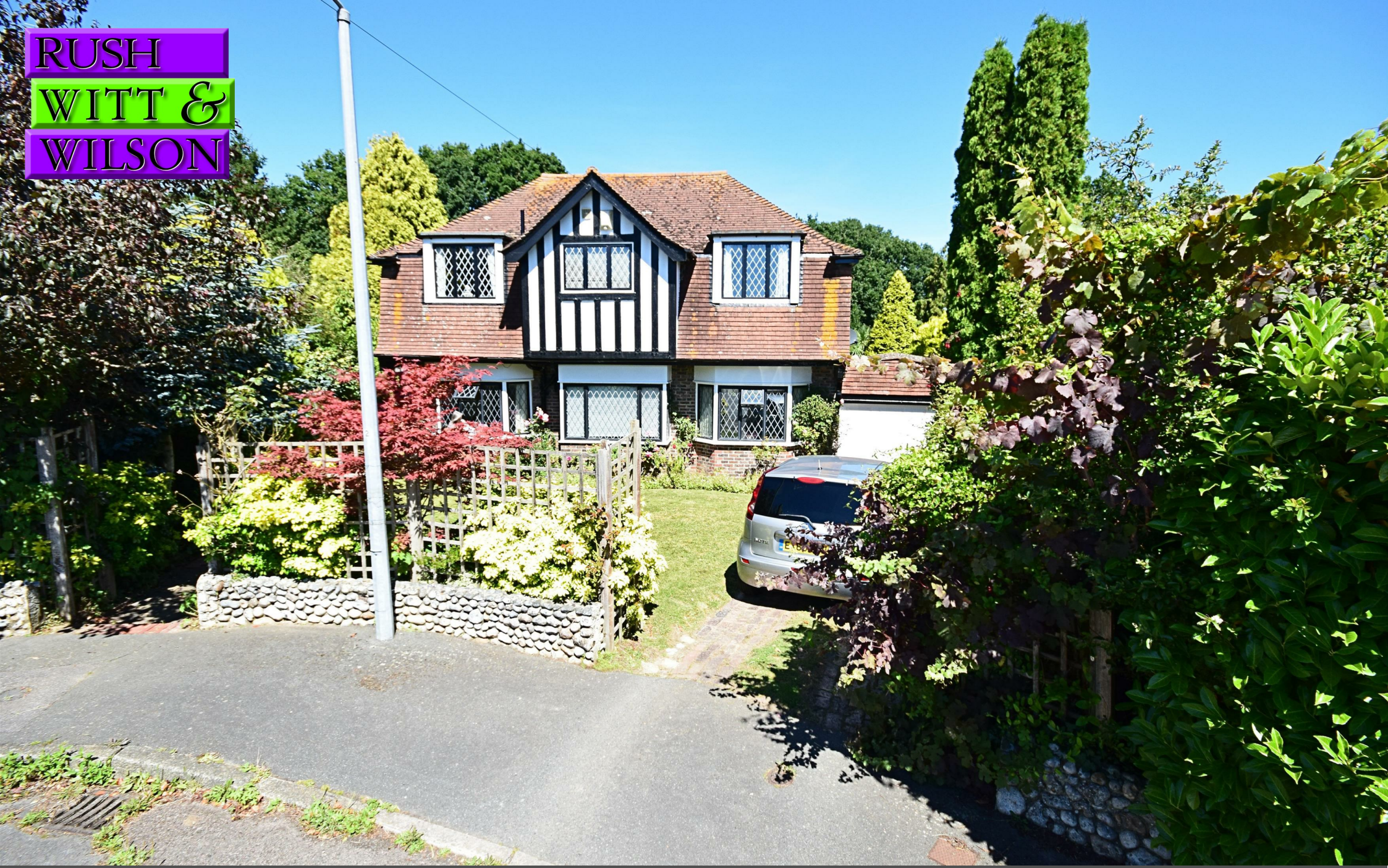
St Ann's Howards Crescent, Bexhill-On-Sea, East Sussex TN39 4QH £499,000